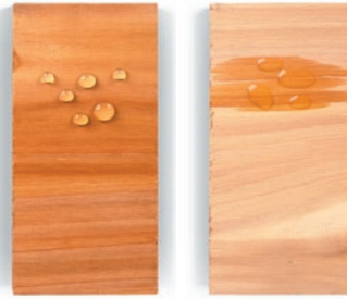
Home Red Cedar